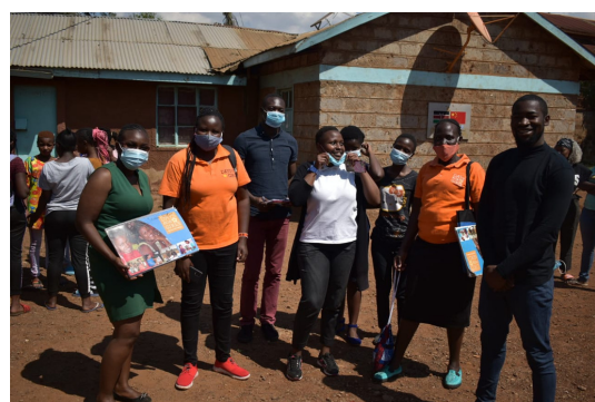
Pictured: Left: Lesson in progress, Middle: Student with booklet Right: Teachers and Rotaract

Until then a KUBWA ASANTE SANA SANA (Big Thank You!) to -